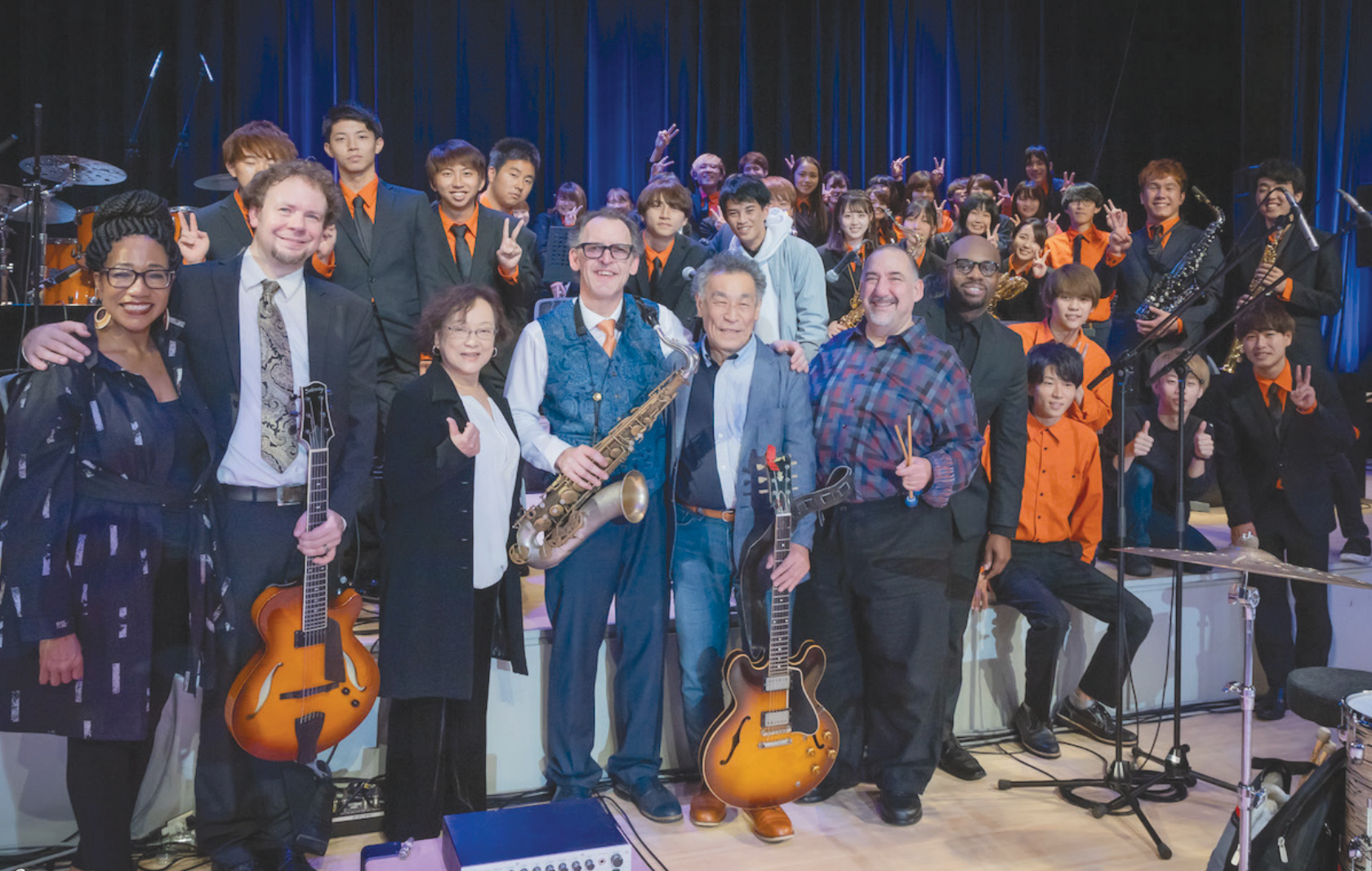
▲ The Detroit Jazz Festival All-Stars celebrate a successful concert in 2019 at the Tottori Jazz Festival in Japan with festival directors and Japanese University jazz musicians.

an educational hub for Wayne State’s jazz students and faculty. In addition, the center will feature a secondary jazz performance area. The Jazz Underground will feature jam sessions, jazz workshops, community engagement programs and a venue for jazz on film. The adjacent lobby will be named the Detroit Jazz Festival Café, where patrons can enjoy refreshments amid Detroit Jazz Festival memorabilia.