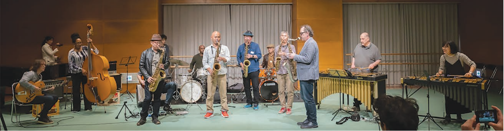
▲ The Detroit Jazz Festival All-Stars at an opening press event in 2019 in Tottori, Japan, for the Tottori Jazz Festival.